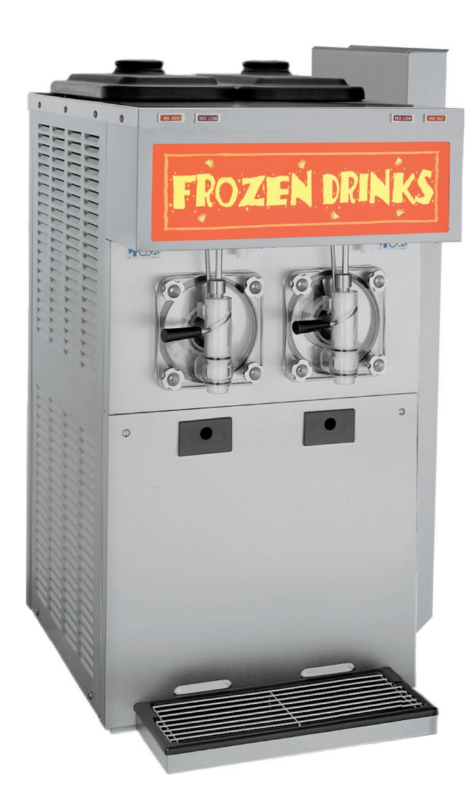
Shown with optional top air discharge chute