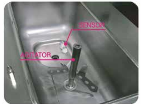
Agitator Mix out & mix low sensors