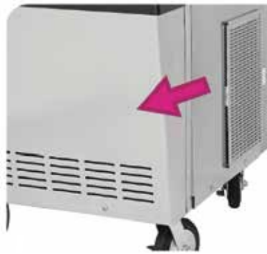
Removable & Washable Air Filter